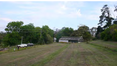
5 Old admin office (former grafting shed) to be reused as 6 Weed glasshouse (former insectary glasshouse) a cafe and local store