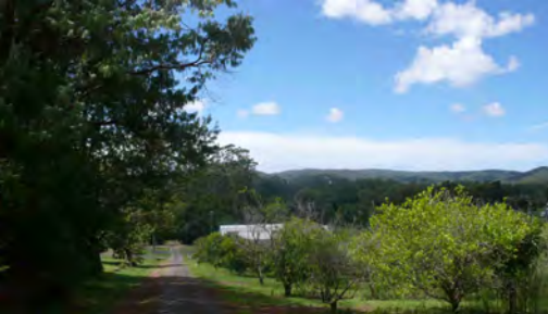
2 Site orchards and green houses, north east propsect to